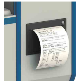
AP-Series built-in printer

* - Additional test vessels are available on request