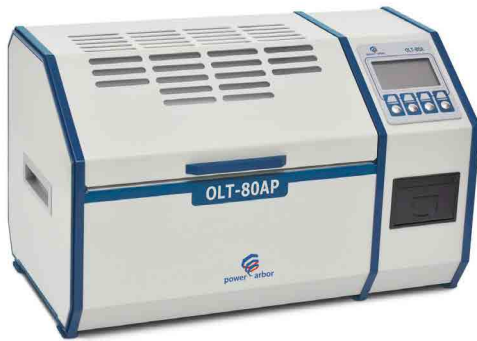
AP-Series: OLT-80AP, OLT-90AP, OLT-100AP