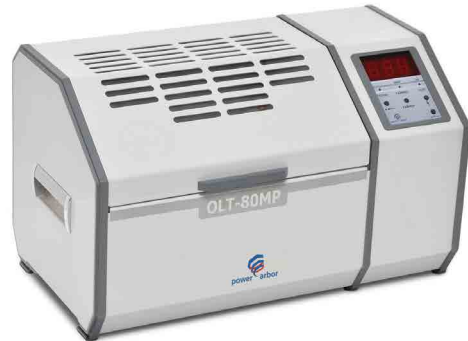
MP-Series: OLT-80MP, OLT-90MP, OLT-100MP